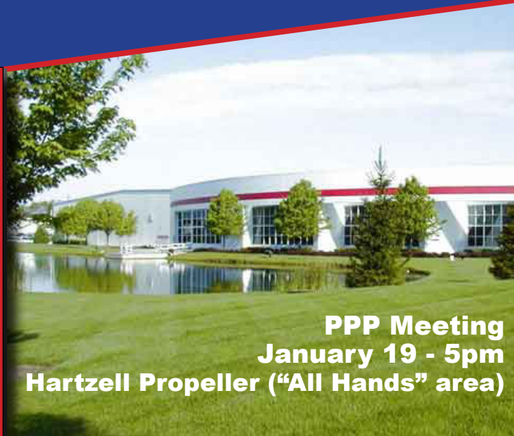
PPP Meeting January 19 - 5pm Hartzell Propeller ("All Hands" area)